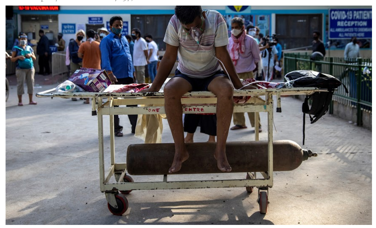
A COVID-19 patient waits to get admitted outside Delhi's Guru Teg Bahadur hospital on 23 April.

[7] (https://caravanmagazine.in/health/modi-government-failure-led-india-covid-19-catastrophe/attachment-17157)