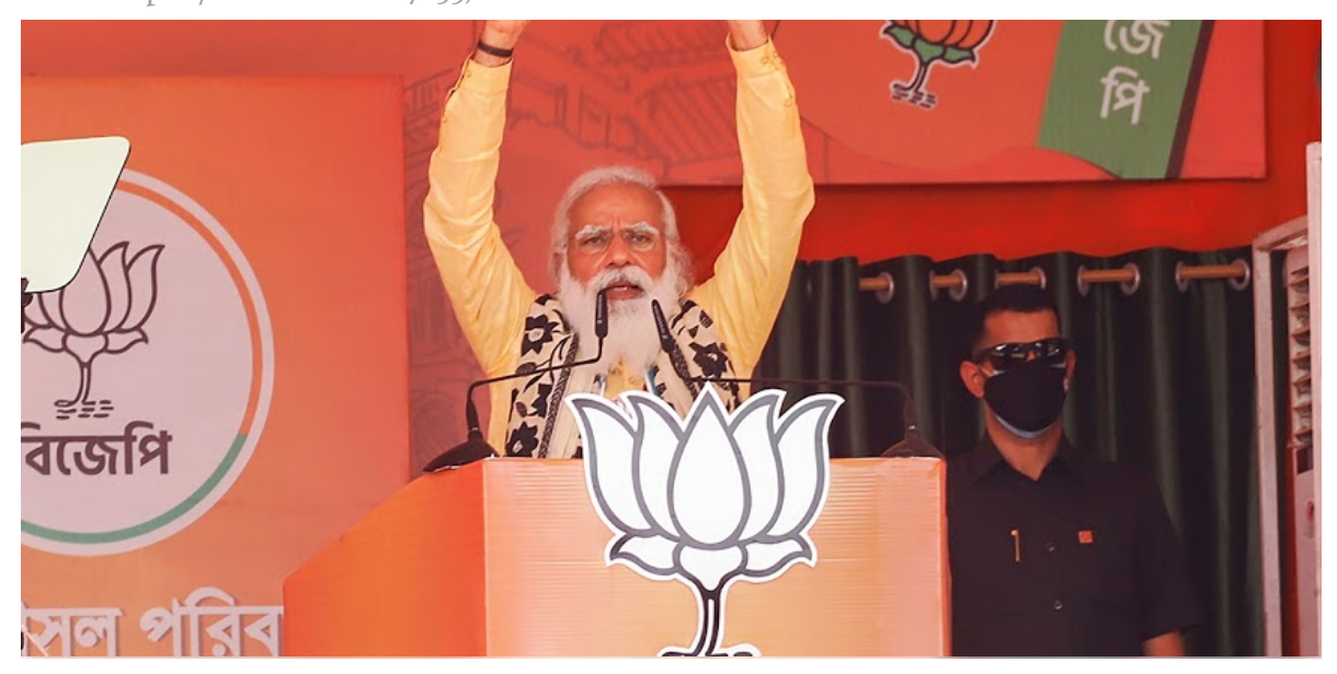
In mid April, as the health infrastructure in several states was collapsing during the second wave of the pandemic, Prime Minister Narendra Modi addressed a massive election rally in West Bengal.

(https://caravanmagazine.in/health/modi-government-failure-led-india-covid-19-catastrophe/attachment-17155)