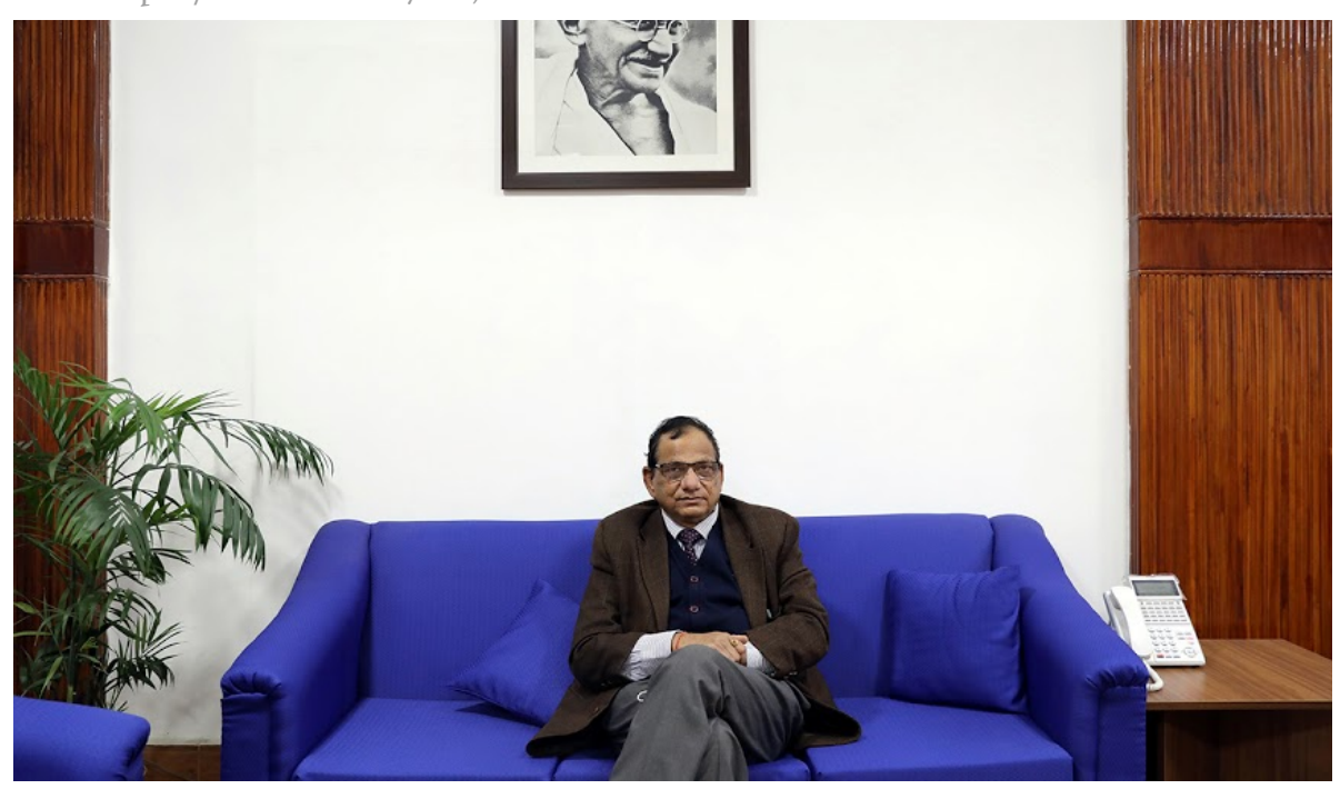
India's pandemic response cannot be scrutinised without understanding the role played by Vinod K Paul, a member of the Niti Ayog, which has become the "backroom" for hashing out all policies that the prime minister's office thinks of.

(https://caravanmagazine.in/health/modi-government-failure-led-india-covid-19-catastrophe/attachment-17160)