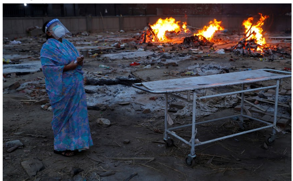
A woman weeps during the cremation of her husband, who died from COVID-19, at a crematorium in Delhi in May. Crematoria have been a more reliable source of data in times when the government has been obsessed with fudging numbers to maintain its image.

Whether it is ramping up testing, accepting the dangers of evolving strains, stocking up on oxygen supplies and life-saving medicines, or investing in human resources—all of these are steps that the Modi