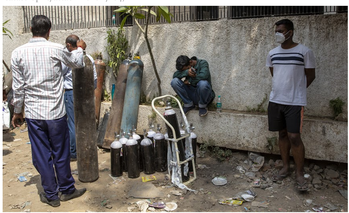
With all oxygen diverted towards medical use, there are concerns over contaminated oxygen cylinders that were earlier used to transport industrial oxygen being used in medical settings. It is suspected to be one of the causes behind the rising infection rates of mucormycosis, or "black fungus."

[7] (https://caravanmagazine.in/health/modi-government-failure-led-india-covid-19-catastrophe/attachment-17164)