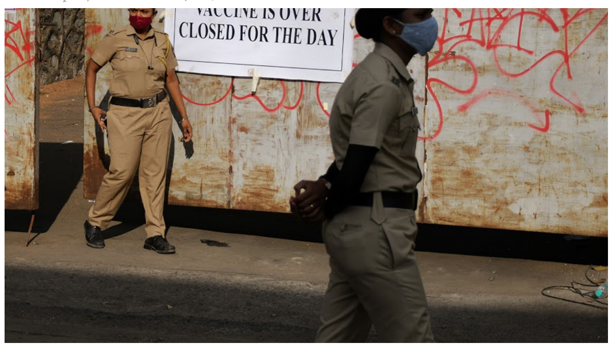
One of the biggest failures of the government was its vaccination program. Today, India faces an acute shortage despite being the largest manufacturer of vaccines.

(https://caravanmagazine.in/health/modi-government-failure-led-india-covid-19-catastrophe/attachment-17161)