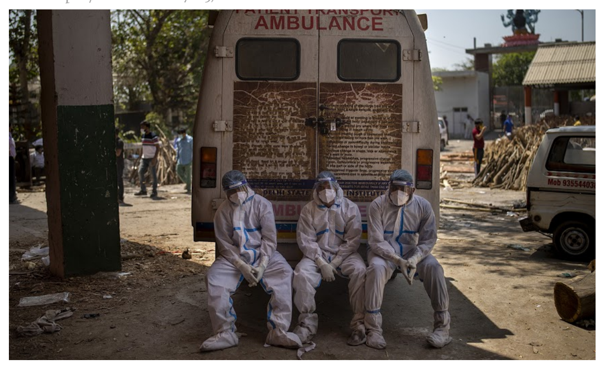
Exhausted healthcare workers sit on the rear step of an ambulance inside a crematorium in Delhi. The government has done little since last year to address the massive shortage of health workers.

(https://caravanmagazine.in/health/modi-government-failure-led-india-covid-19-catastrophe/attachment-17165)